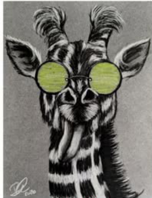
Sir Licks A Lot

Marshfield Parks & Recreation Office 211 E. 2nd Street #111 Marshfield, WI 54449